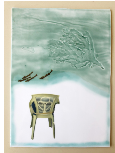
Watching the Beach. Porcelain imprint, decal. 2023. 20 x 29cm. 250 CHF.