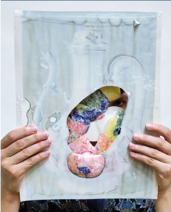
Pool Teneriffa. Porcelain, porcelain/glaze, overglaze decal. 2019. 34 × 25 × 2cm. 1800 CHF.