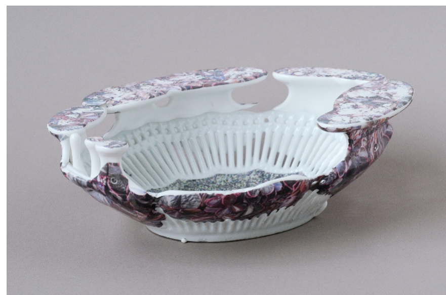
Park. Porcelain, glaze/porcelain, decals. 2021. 27 × 19 × 9cm. 900 CHF.