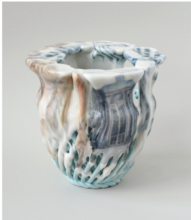
Greenhouse. Stoneware pot, glaze/porcelain, decals. 2022. 22 × 20 × 20cm. Sold.