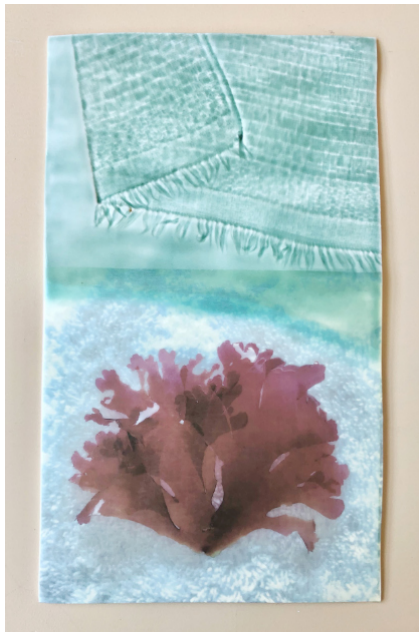
Seaweed Collecting Drying. Porcelain imprint. 2023. 19 x 30cm. 250 CHF.