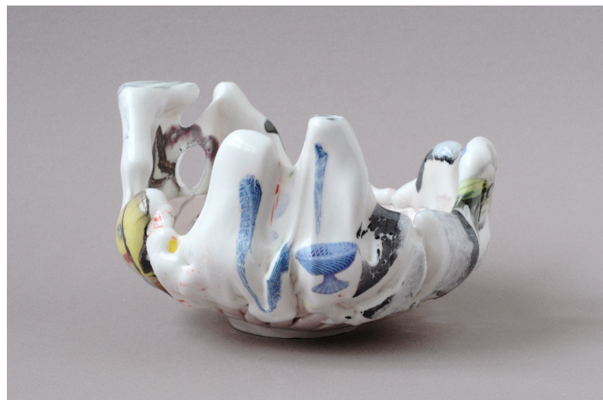
Fruit Bowl with Butterfly. Earthenware, glaze/porcelain, decals. 2021. 22 × 20 × 12.5cm. 1600 CHF.