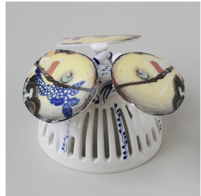
Lemon Lid. Stoneware lid, glaze/porcelain, decals under- and overglaze. 2022. 15 × 15 × 9cm. 400 CHF.