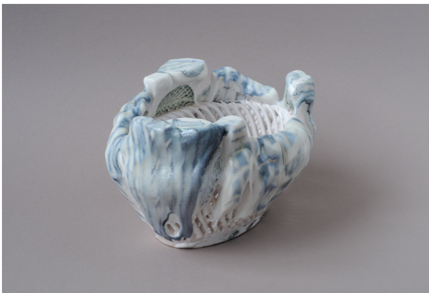
Braided. Earthenware, glaze/porcelain, decals. 2021. 25 × 20 × 15cm. 1600 CHF.