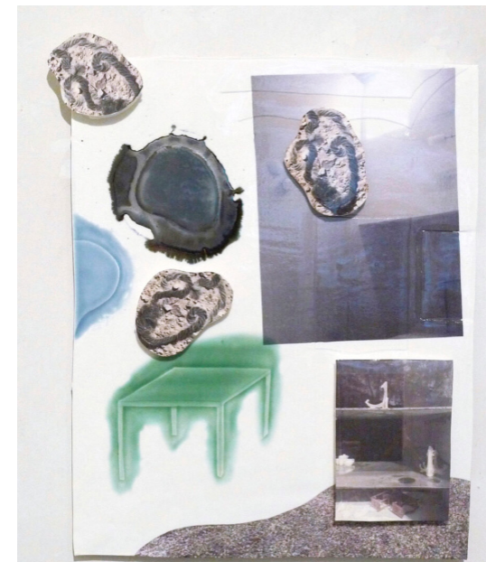
Space. Porcelain, hand carving, celadon, decal overfired. 2019. 36 × 29 × 1.6cm. 1800 CHF.