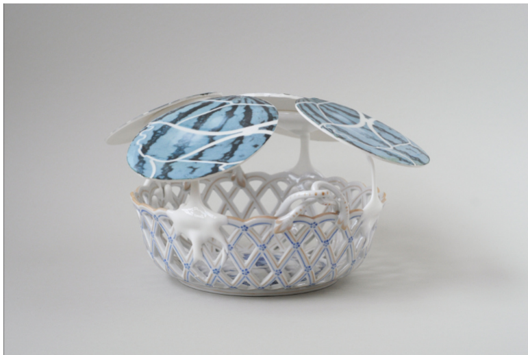
Melon Roof. Herend porcelain bowl, glaze/porcelain, decals. 2022. 32 × 32 × 19cm. 1800 CHF.