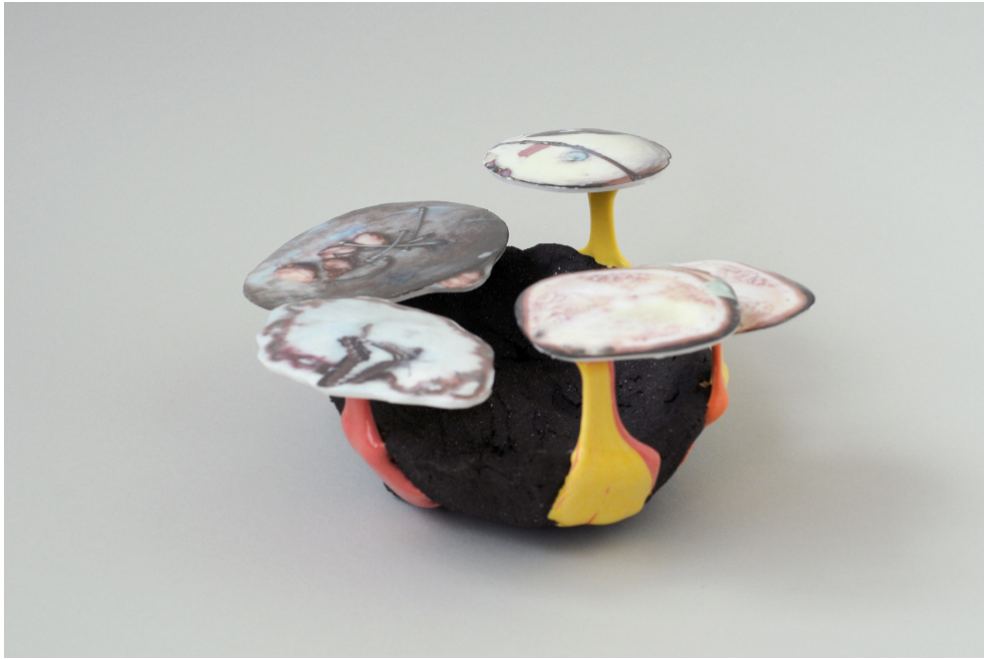
Humus. Black clay, glaze/porcelain/pigments, decals. 2022. 24 × 20 × 11 cm. 900 CHF.