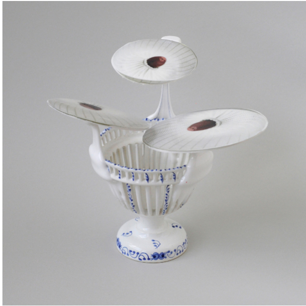
Fly Cap Apple. Stoneware bowl, glaze/porcelain, decals. 2022. 23 × 19 × 21cm. 1200 CHF.