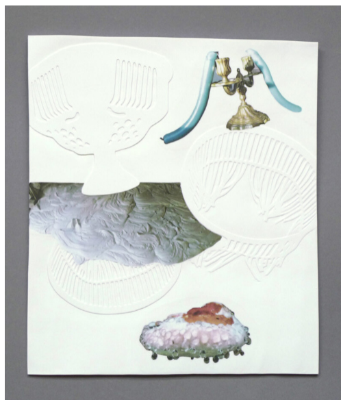
Materiality. Porcelain, hand carving, decal. 2020. 31.5 × 37 × 0.5cm. 1800 CHF.