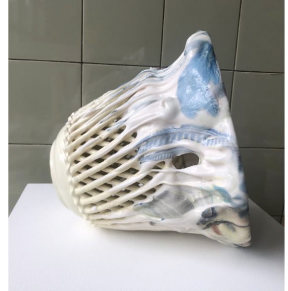
Lemon Basket. Black clay, glaze/porcelain/pigments, decals. 2022. 24 × 24 × 24cm. 1600 CHF.