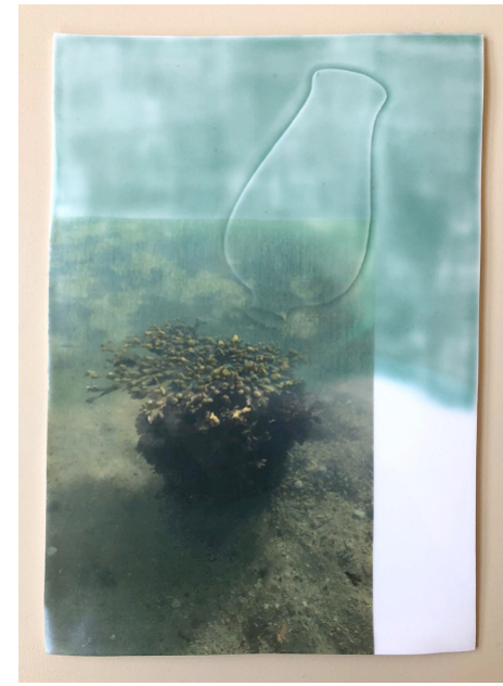
Coastline Discoveries Brittany. Handcarved porcelain, decals.2023. 20 x 29cm. 250 CHF.