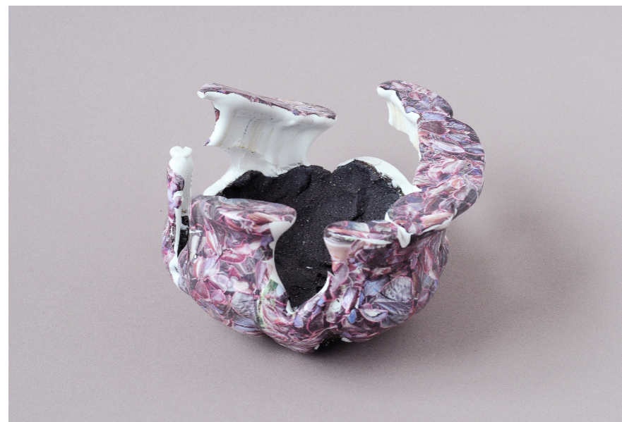
Bursted Bush. Black clay, glaze/porcelain, decals. 2021. 18 × 17 × 12cm. 1100 CHF.