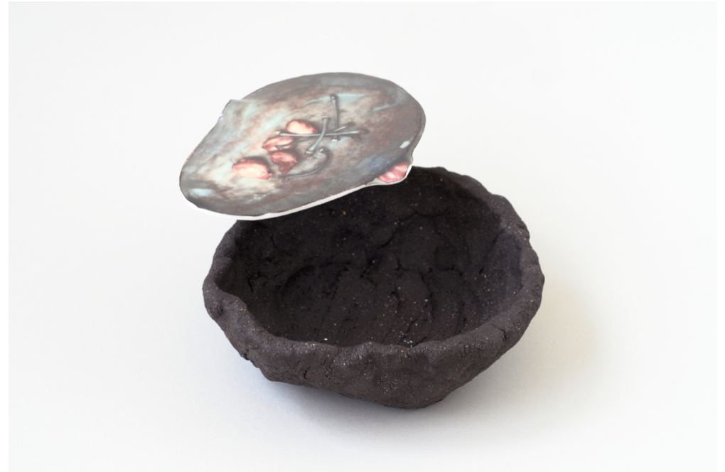
Avocado bowl. Black clay, glaze/porcelain/pigments, decals. 2022. 16 × 16 × 9 cm. Sold.