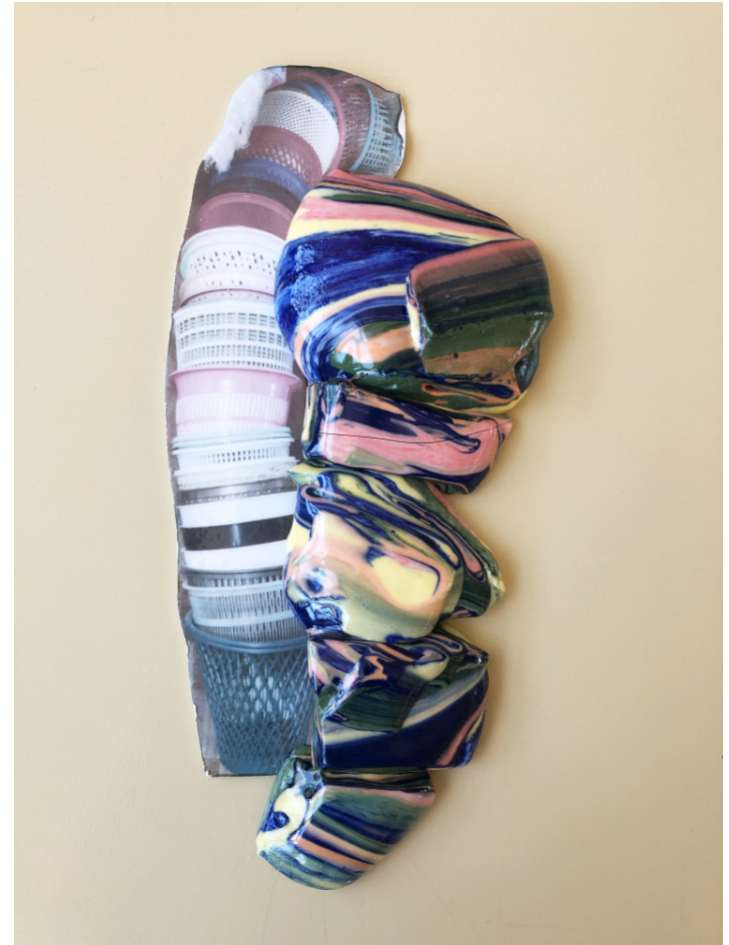
Plastic Basket Tower. Porcelain, porcelain/glaze, pigments, decal. 2023. 10x30x1.5cm. 200 CHF.