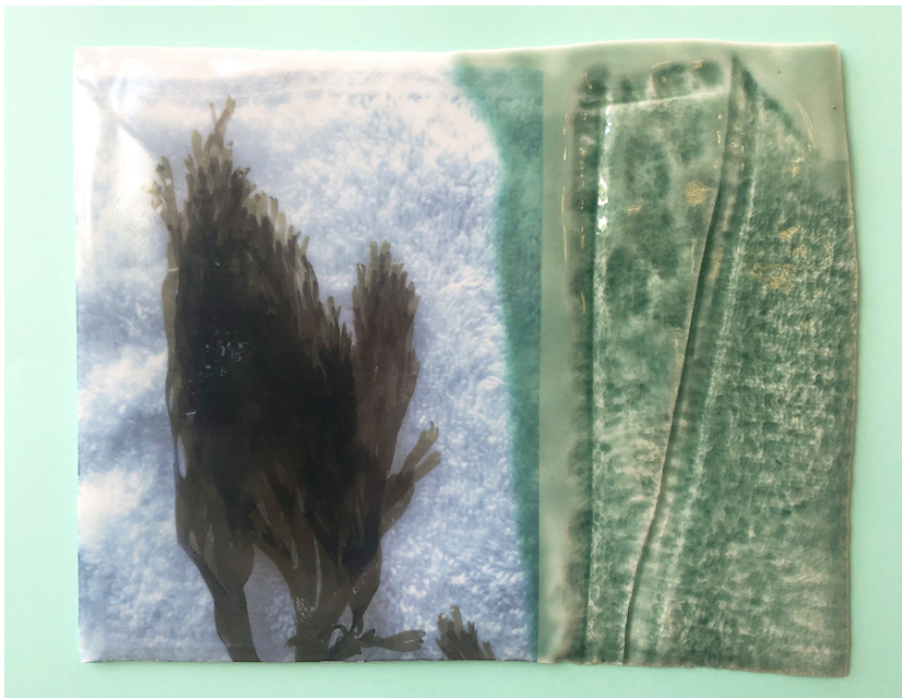
Seaweed. Porcelain. 2022. 19 x 23.5cm. 250 CHF.