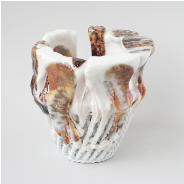
Pomelo Spiral. Stoneware pot, glaze/ porcelain, decals. 2022. 20 × 20 × 20cm. Sold.