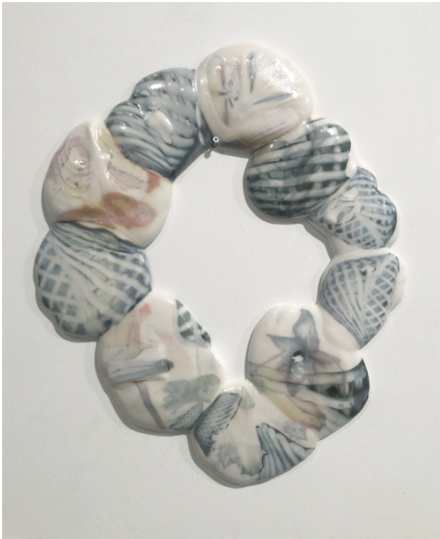
Braided ring, glaze/ porcelain, decals. 2023. 50 × 40 × 2cm. 1000 CHF.